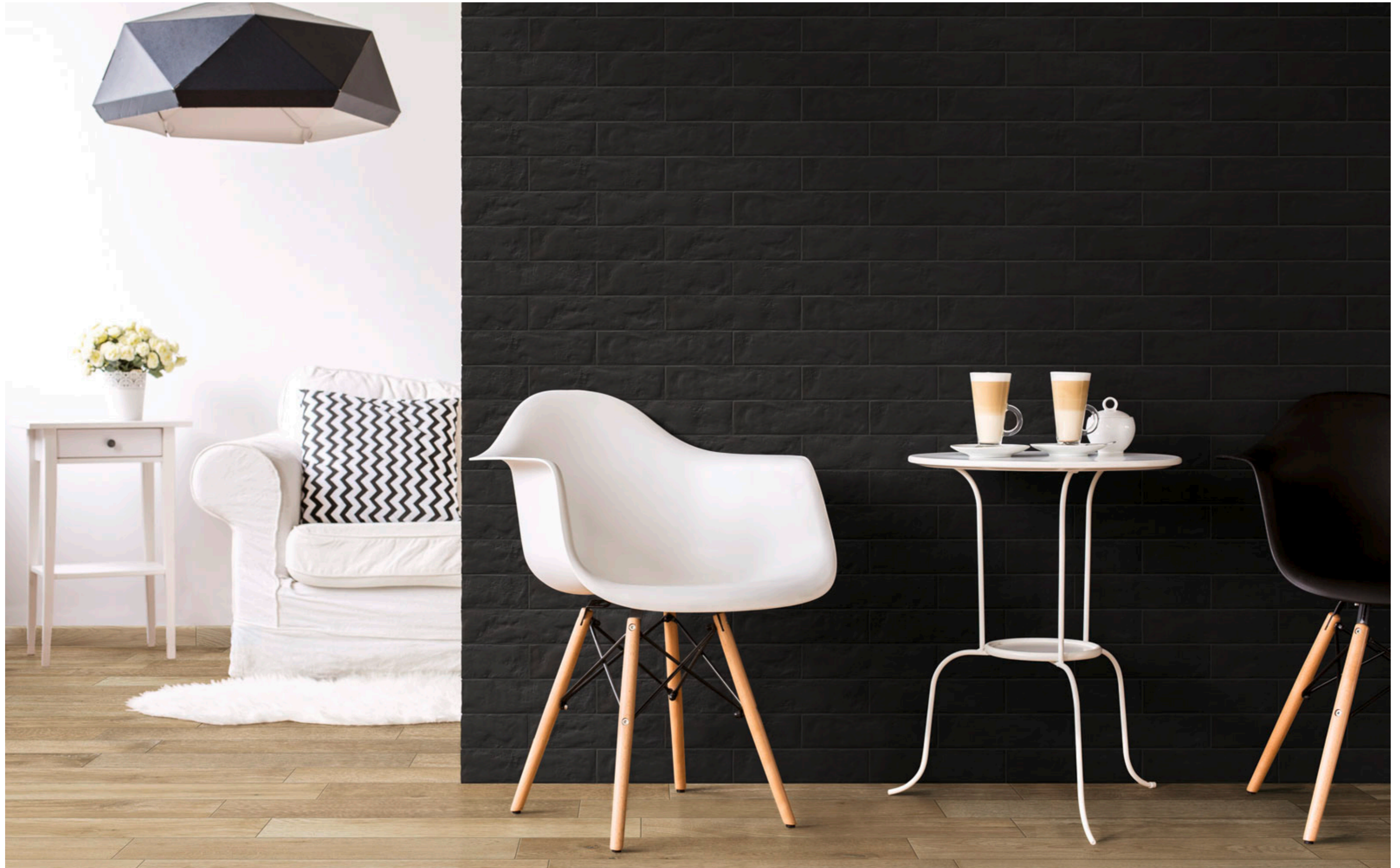
M03A Bricco Carbone 7x28cm M005 Treverkfusion Neutral 10x70cm