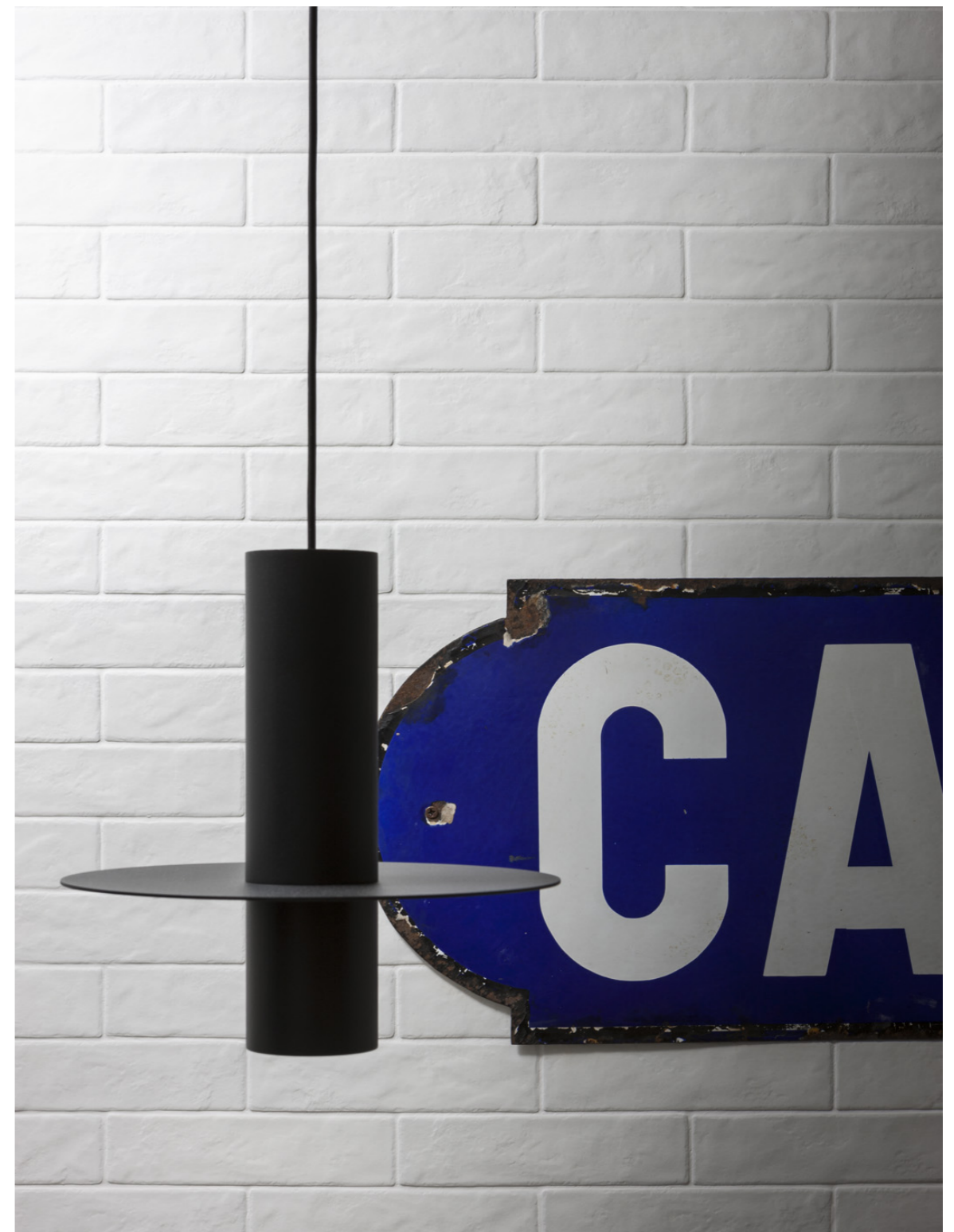
M035 Bricco Bianco 7x28cm