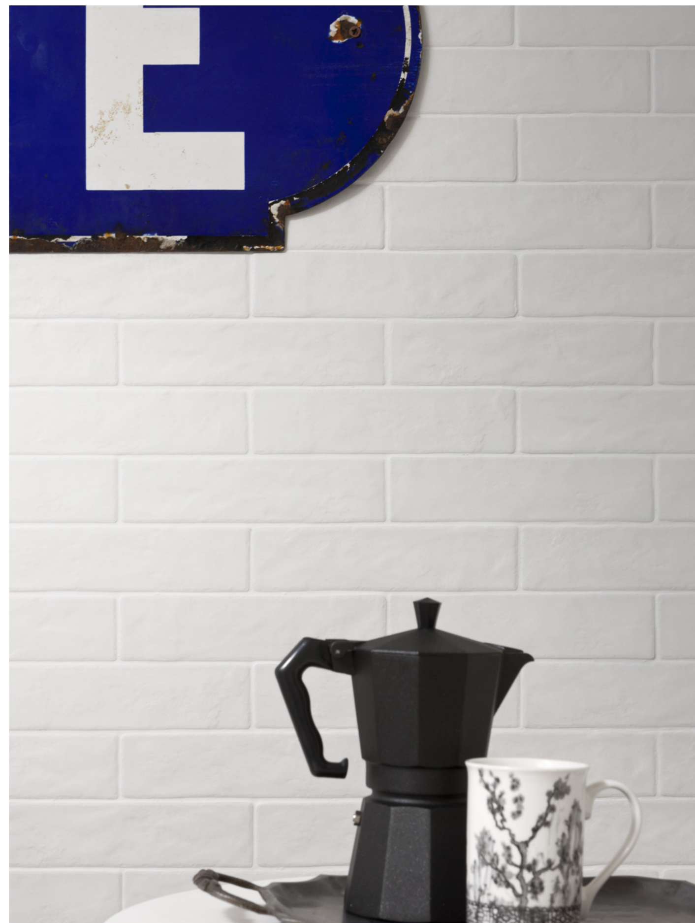
M035 Bricco Bianco 7x28cm