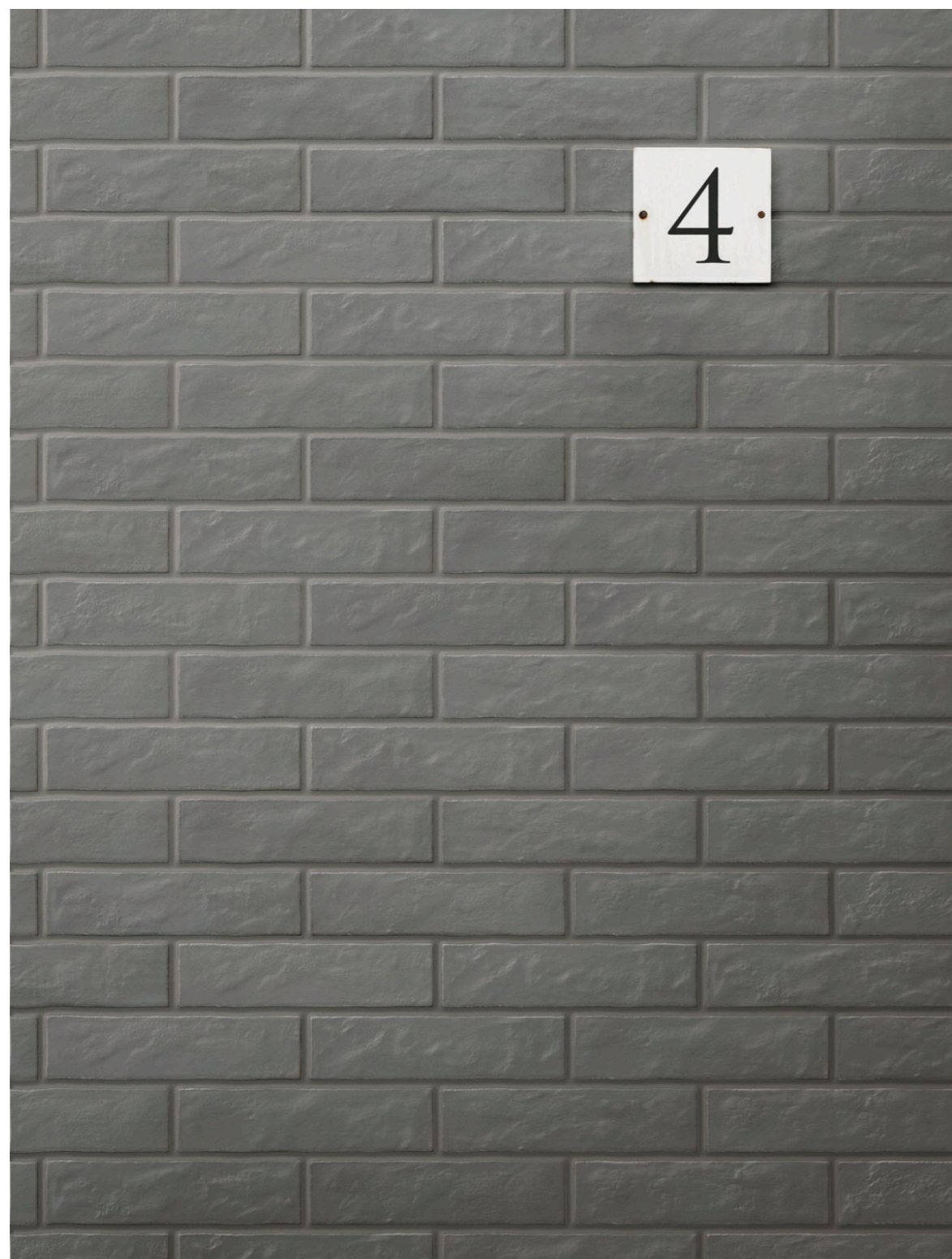
M039 Bricco Cemento 7x28cm