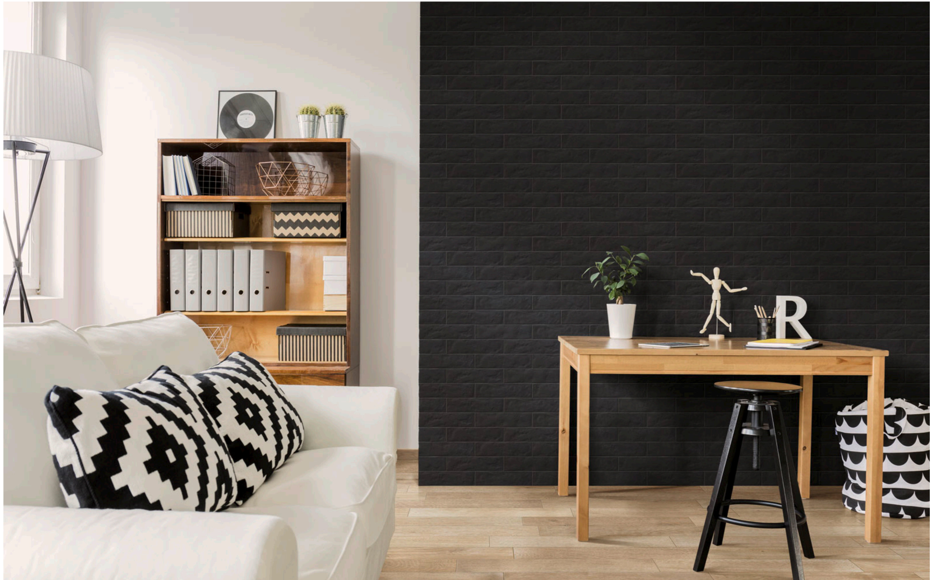
M03A Bricco Carbone 7x28cm M005 Treverkfusion Neutral 10x70cm