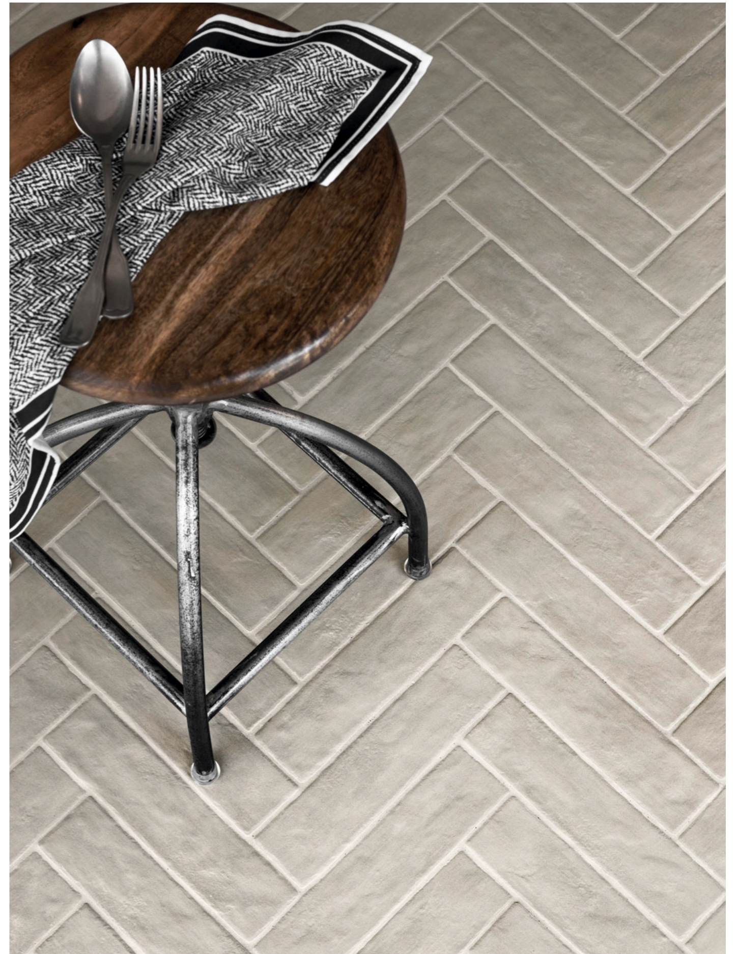
M038 Bricco Fango 7x28cm