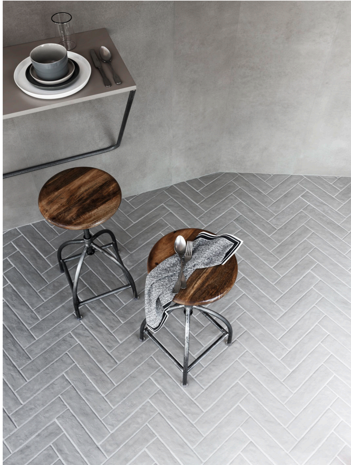
MMWX Powder Smoke Rt 75x150cm M038 Bricco Fango 7x28cm