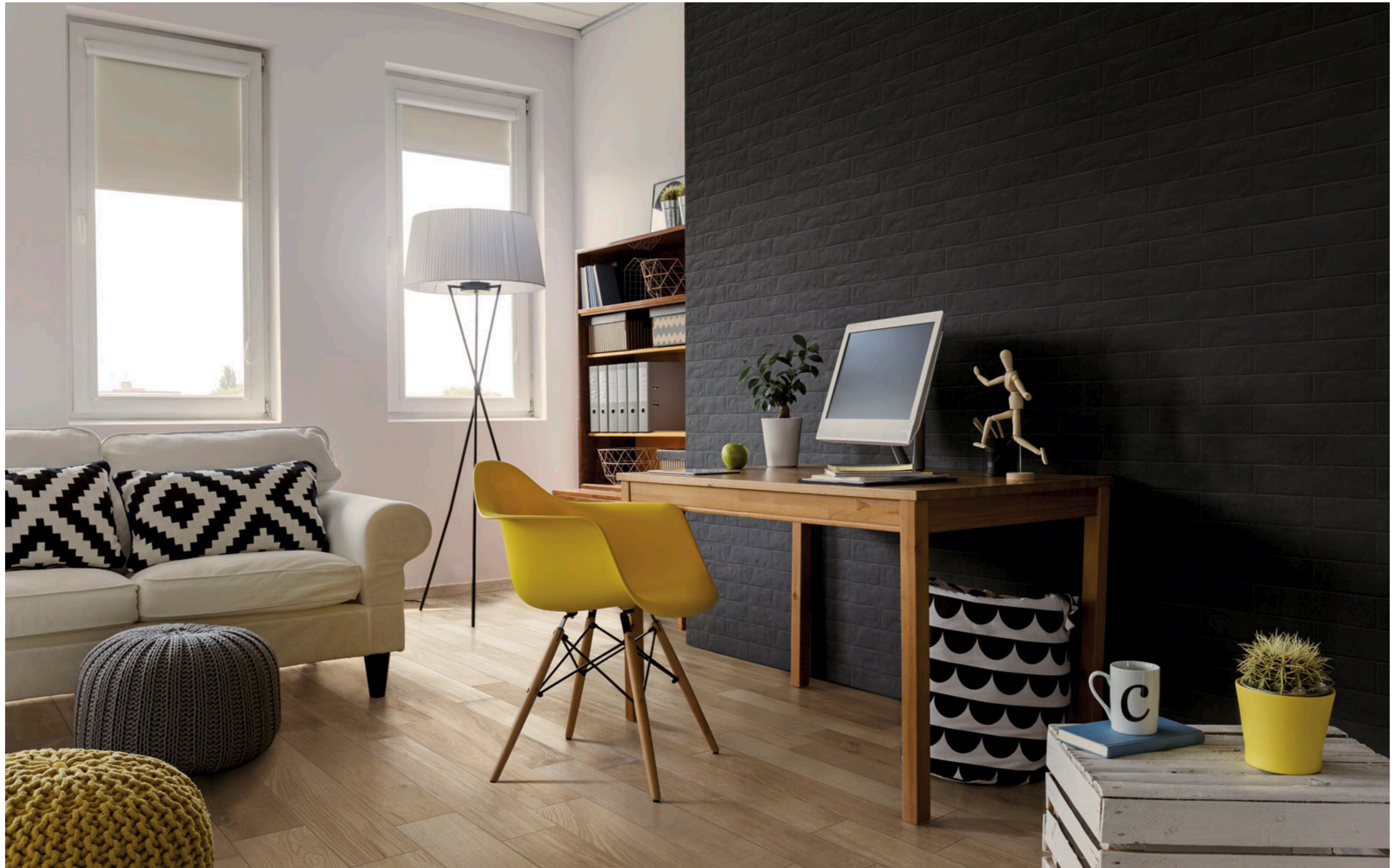
M03A Bricco Carbone 7x28cm M005 Treverkfusion Neutral 10x70cm