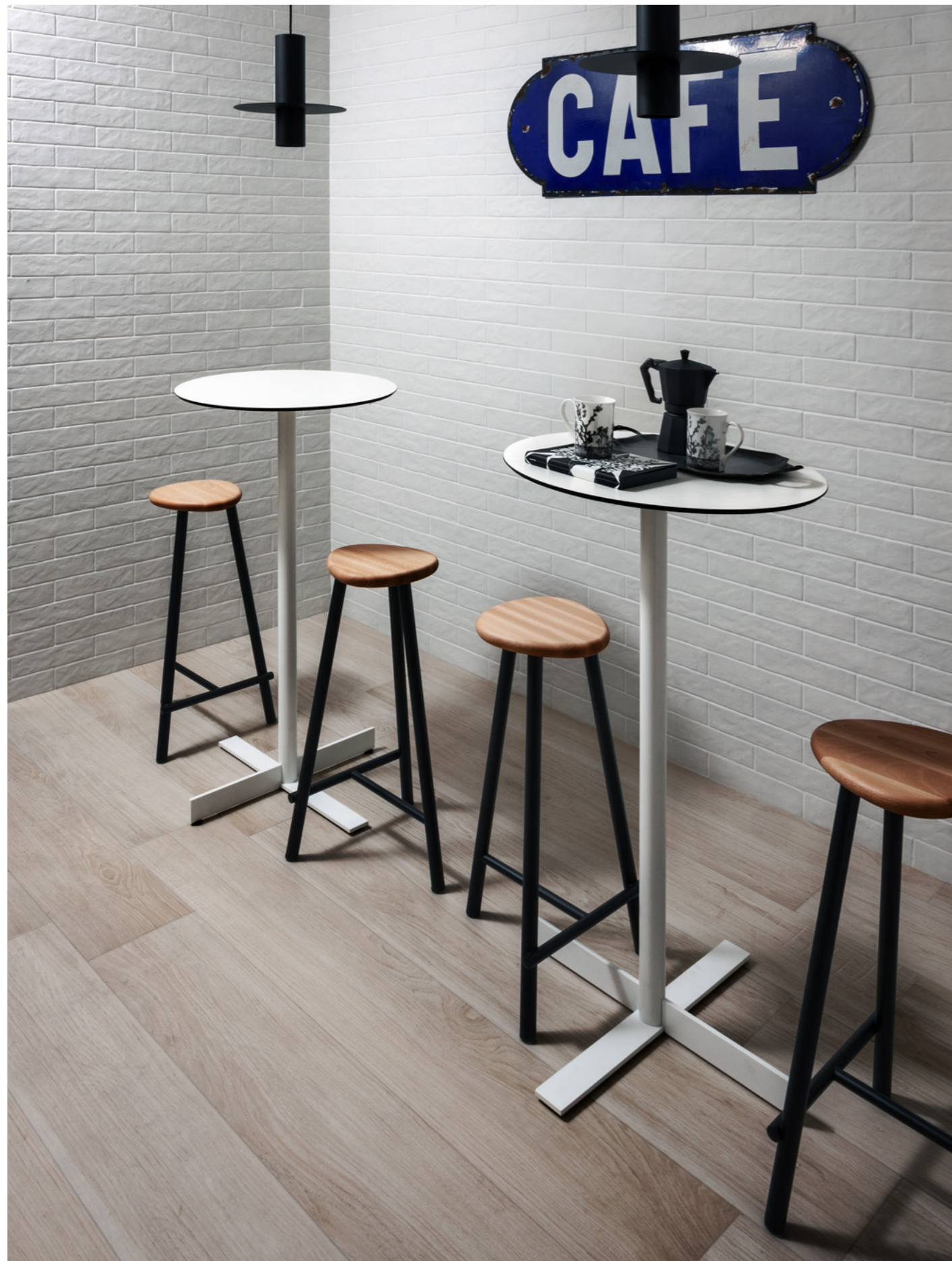
M05E Treverkmust White Rt 25x150cm M035 Bricco Bianco 7x28cm